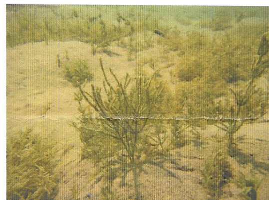
Starry stonewort (front, center), much more robust than the surrounding native muskgrasses ( Chara spp.).

This Quick Guide is part of a series on aquatic invasive species, and may be reproduced for educational purposes. Visit us at www.uwsp.edu/uwexlakes/clmn or www.goldensandsrscd.org/our-work/water to download this series of handouts.