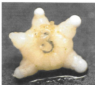
Star-shaped bulbils give the starry stonewort its name.

North American Distribution: Michigan, northern Indiana, and the northeast United States. Recently found in one lake in southeast Wisconsin.